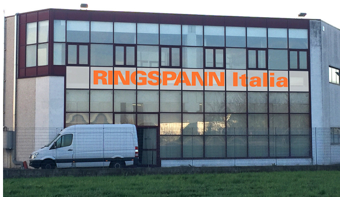
RINGSPANN Italia is headquartered in Lainate just outside the industrial metropolis of Milan.

RINGSPANN strengthens its international presence with new a subsidiary near Milan